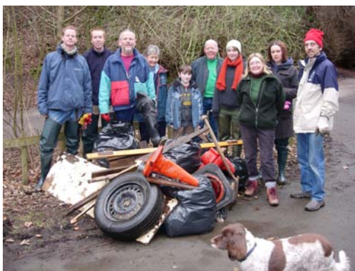
The afternoon's rubbish haul. (dog not included)